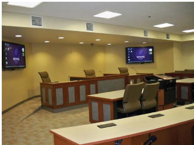
The mock courtroom on the campus of Winona State University.