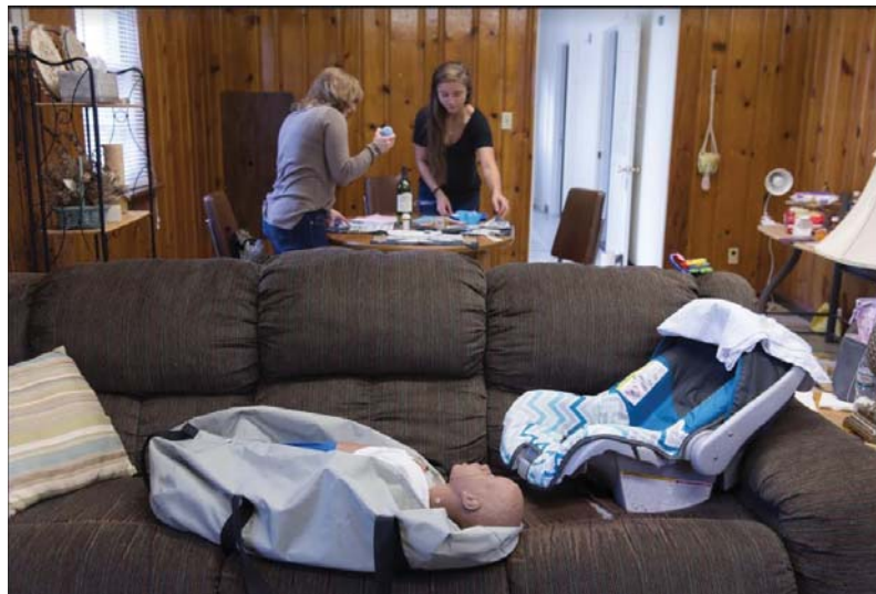
Inside the mock house on the campus of the University of Illinois Springfield.