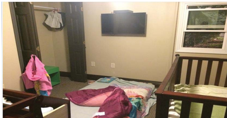
The CAST program on the campus of Northwest Arkansas Community College utilizes a two story mock house for simulation training of students and professionals in the field. NWACC also has courtrooms and forensic interview rooms.