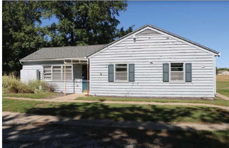
The mock house at the University of Illinois Springfield where CAST students conduct simulated child protection assessments or investigations.