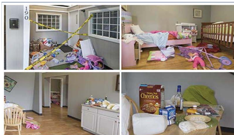
The mock house on the campus of University of South Carolina Upstate where CAST students receive experiential training in child protection assessments and investigations.