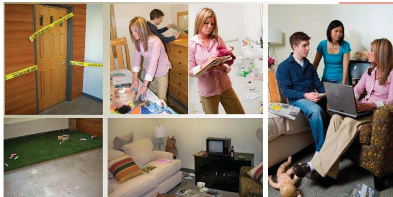
CAST students conducting simulation training in the mock house on the campus of Winona State University.